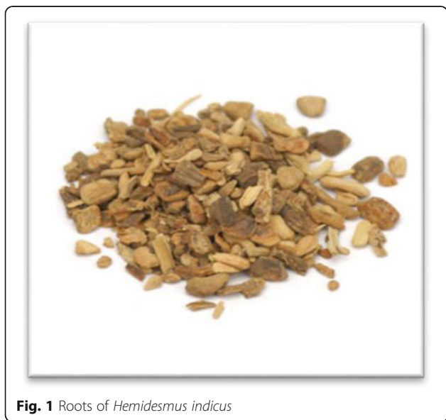
Fig. 1 Roots of Hemidesmus indicus

Streptozotocin, 2,2-diphenyl-1-p-picryl- hydrazyl (DPPH), ursolic acid and quercitrin hydrate were procured from Sigma Chemical Co. St. Louis, Missouri, USA. HPLC grade acetonitrile were purchased from Merck Chemicals, Mumbai, India. Pyrogallol, ethylenediamine tetra acetic acid (EDTA) and other chemicals and solvents of AR grade were purchased from Hi Media Co. Mumbai, India.